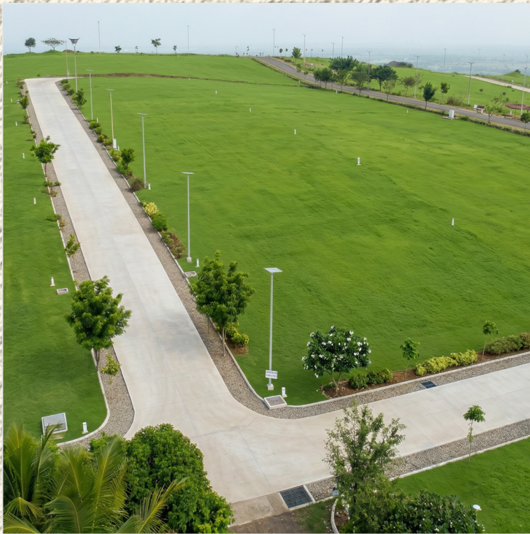
INTERNAL CONCRETE ROAD